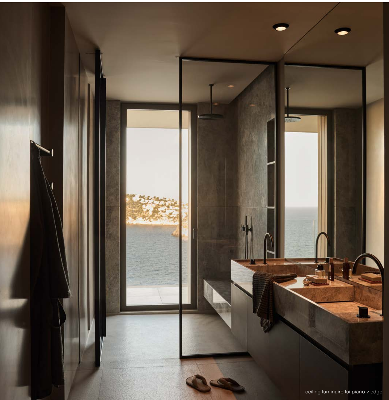
ceiling luminaire lui piano v edge

Inside, a spa-like bathroom, outside, the sea. Here, the space flows across all architectural boundaries, accompanied by the light of the lui piano v edge spotlight, which perfectly complements the daylight mood.