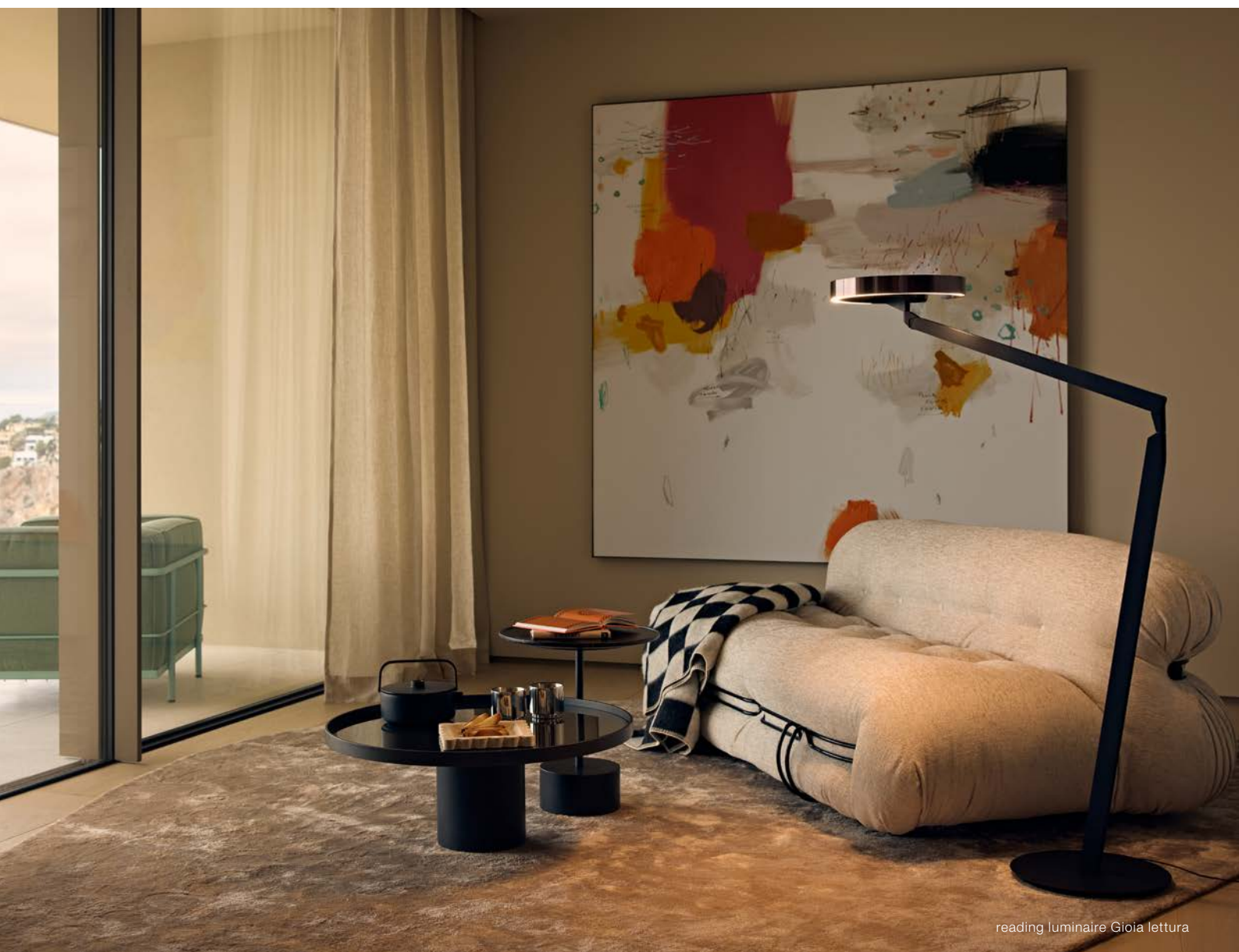
reading luminaire Gioia lettura

Socialising on one hand, privacy on the other: Directly adjacent to the master suite is a cozy lounge where you can withdraw. From here, too, there is a fantastic view over the bay that you won't want to miss. Next to the sofa, the Gioia lettura adjustable floor luminaire, with its focus light, provides the ideal illumination for reading and creates an inviting atmosphere throughout the room