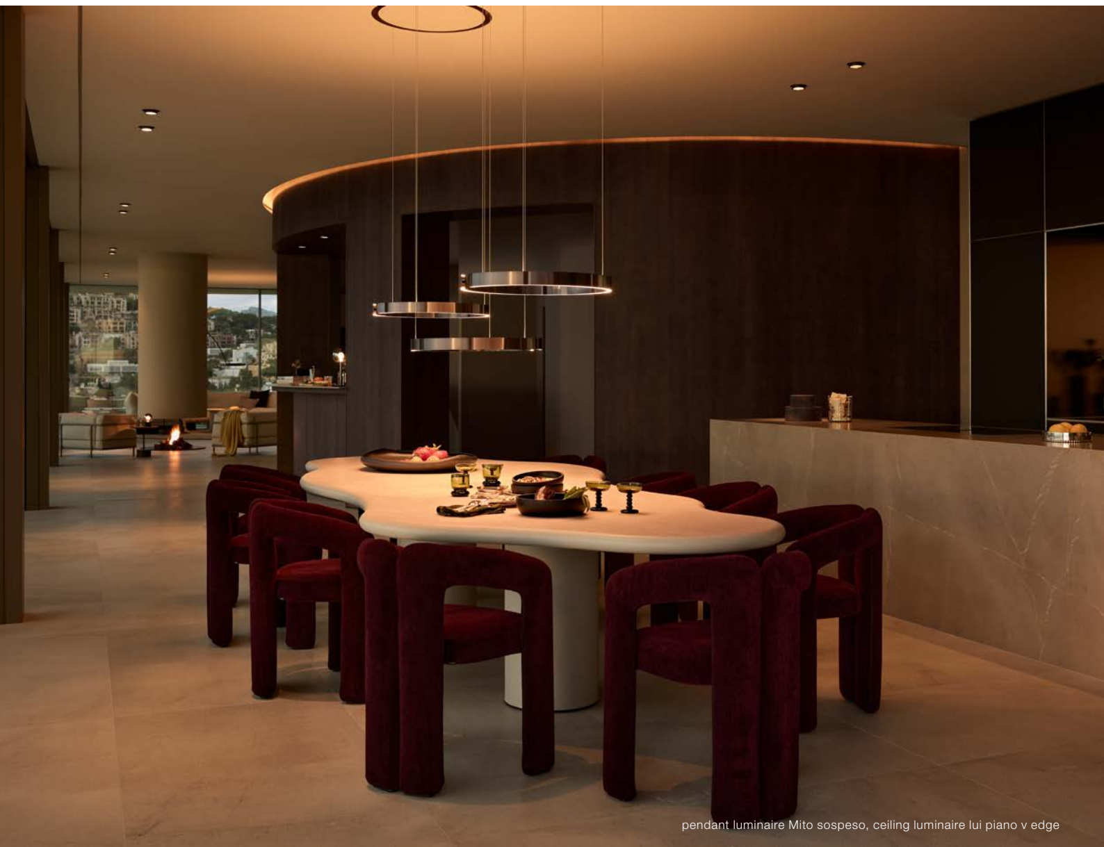
pendant luminaire Mito sospeso, ceiling luminaire lui piano v edge

The top floor accommodates the living and dining area with its own bar, show kitchen and prestigious dining area. To make this a special highlight, three height-adjustable Mito cosmo move units were chosen, which are positioned above the table. But this is not the only reason for this decision. The generous glass surfaces on this level can be opened completely. This means that the luminaire can be completely retracted into the ceiling in windy conditions. Recessed downlights from the lui spotlight series are used as an accent to highlight individual areas.