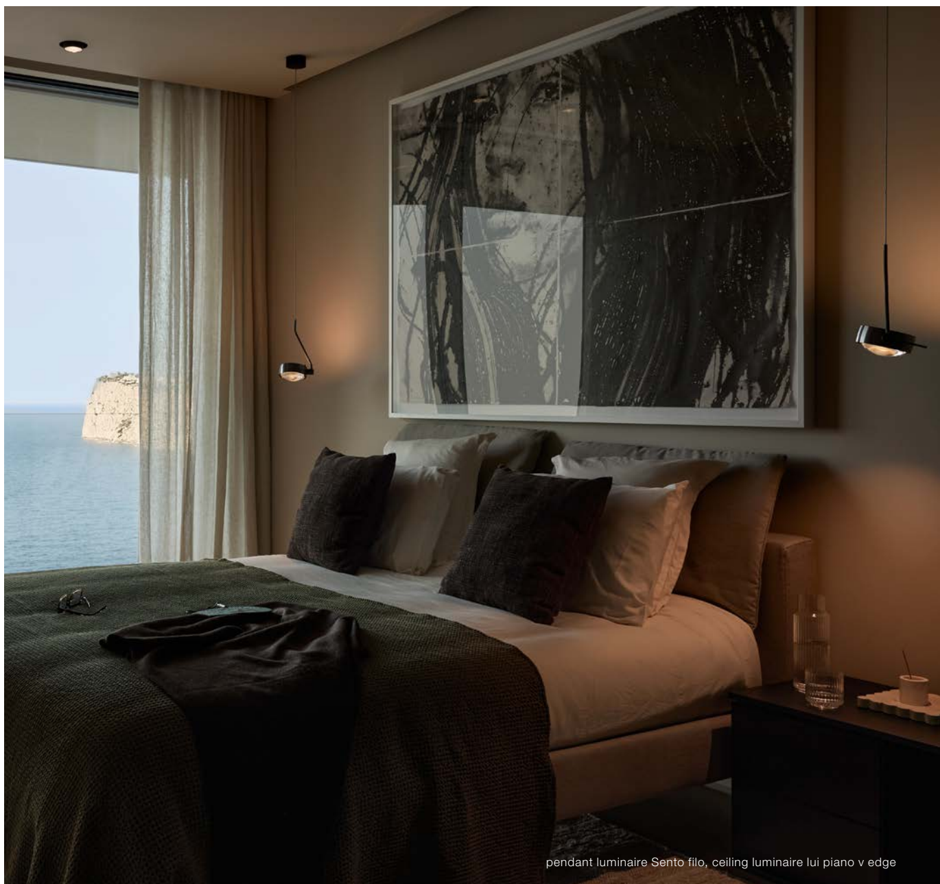
pendant luminaire Sento filo, ceiling luminaire lui piano v edge

While the lui piano v edge spotlights provide harmonious ambient lighting, Sento filo is the highlight at the headboard area- highlight – not only from an aesthetic point of view, but also from a technical one, with its rotatable head and directional light.